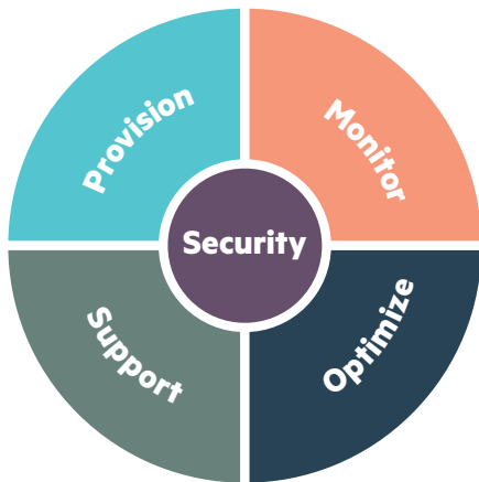
Figure 1. HPE iLO management—Core lifecycle management functions built in for instant availability